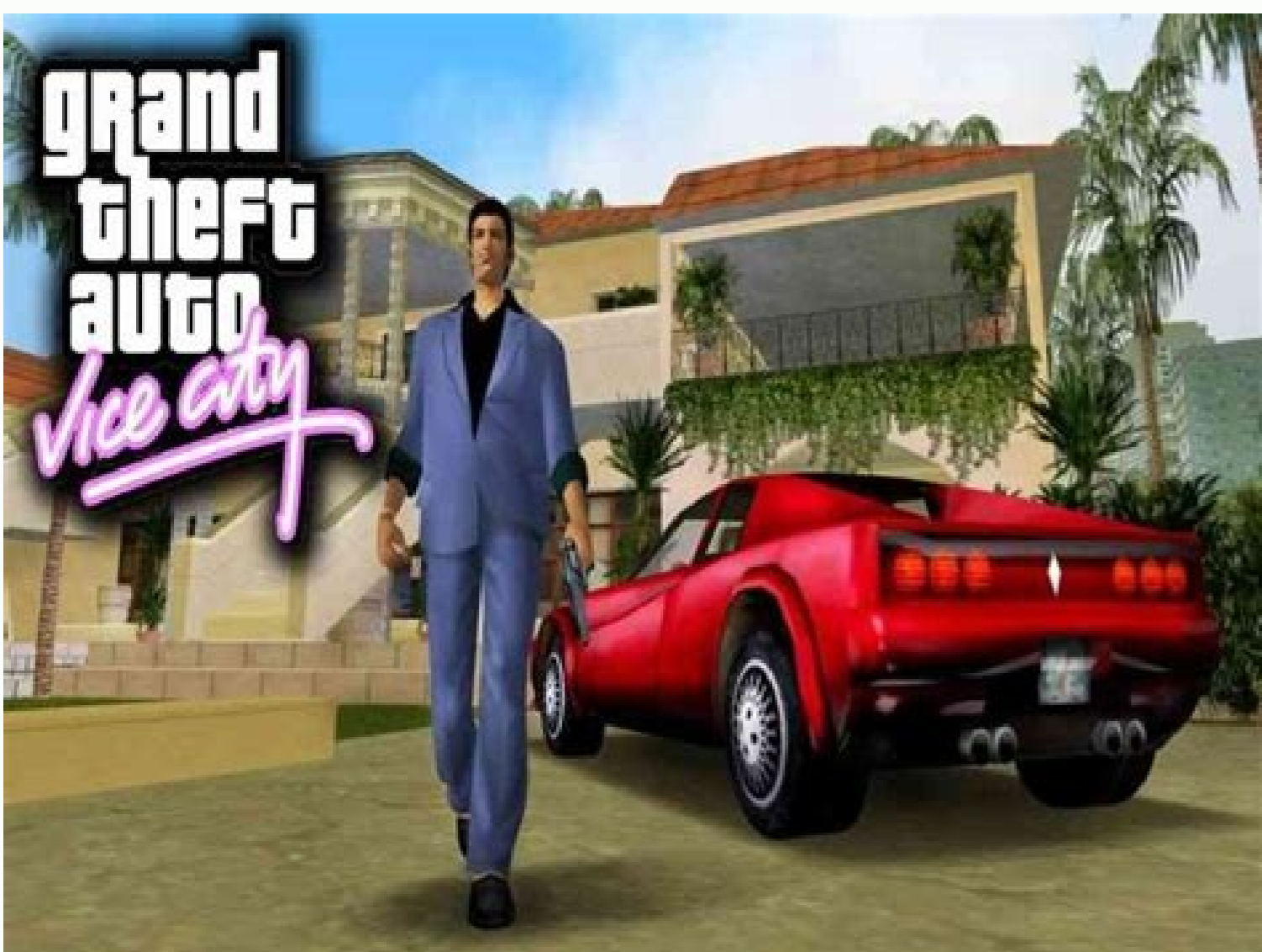
Gta 3 online no download. Gta vice city play online no download. Gta 4 online no download. Games like gta online no download. Gta v for free 3d online no download. Gta san andreas online no download. Free gta games online no download. Gta 5 online no download.